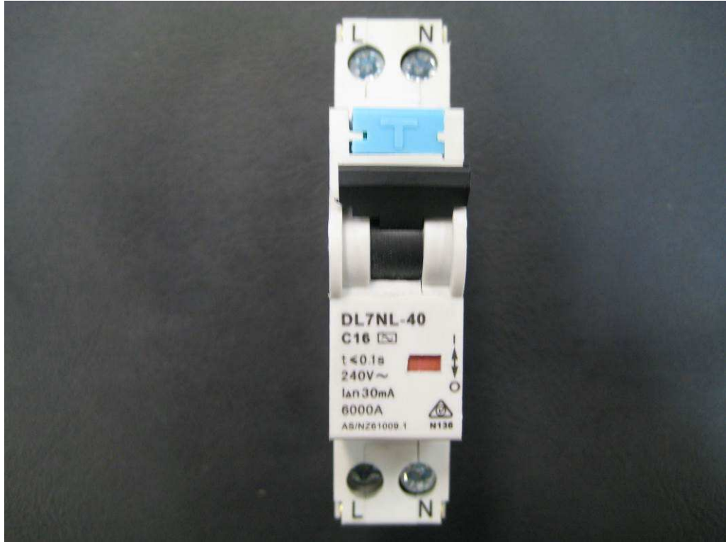
Test sample front View